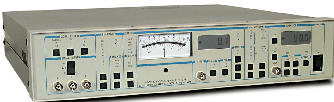
SR510 Lock-In Amplifier

An internal voltage-controlled oscillator provides both an adjustable-amplitude sine wave output and a synchronous, fixed-amplitude reference output. The sine wave amplitude can be set to 0.01, 0.1 or 1 Vrms, and it can drive up to 20 mA. The oscillator frequency is controlled by a rear-panel voltage input and can be adjusted between 1 Hz and 100 kHz. Typically, the sine wave output is used to excite some aspect of an experiment, while the reference output provides a frequency reference to the lock-in.