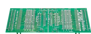
Model 205PCB 205 Cable Tester, Replacement PCB One 205PCB is included with each model 205